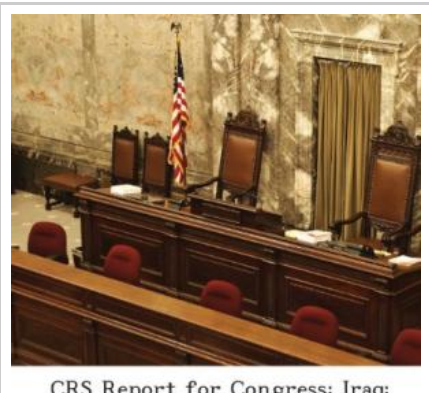
CRS Report for Congress: Iraq: U.S. Efforts to Change the Regime January 8, 2003 - RL31339

Congressional Research Service: The Library of Congress